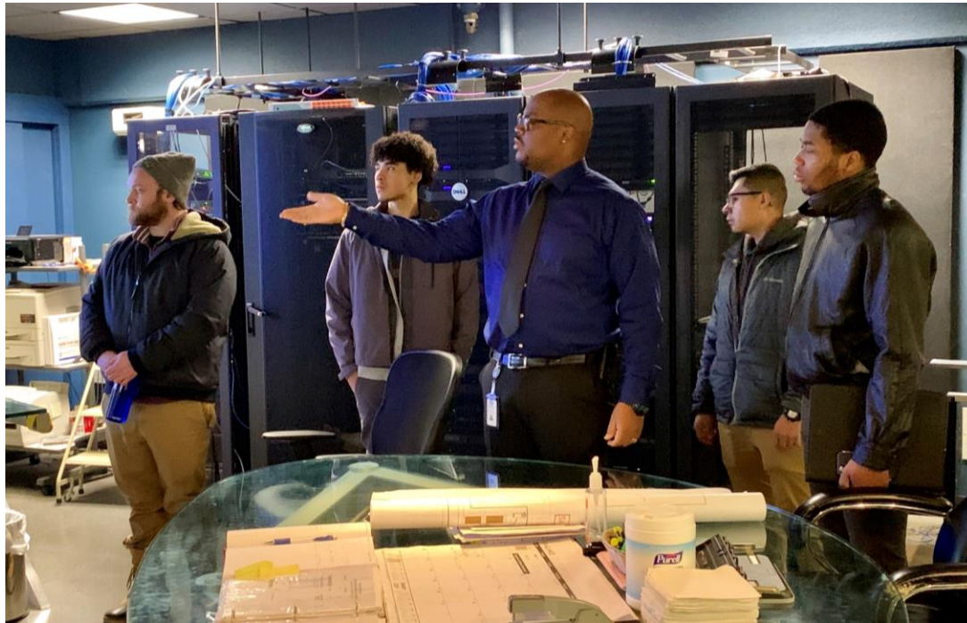
PUM students tour the RWA