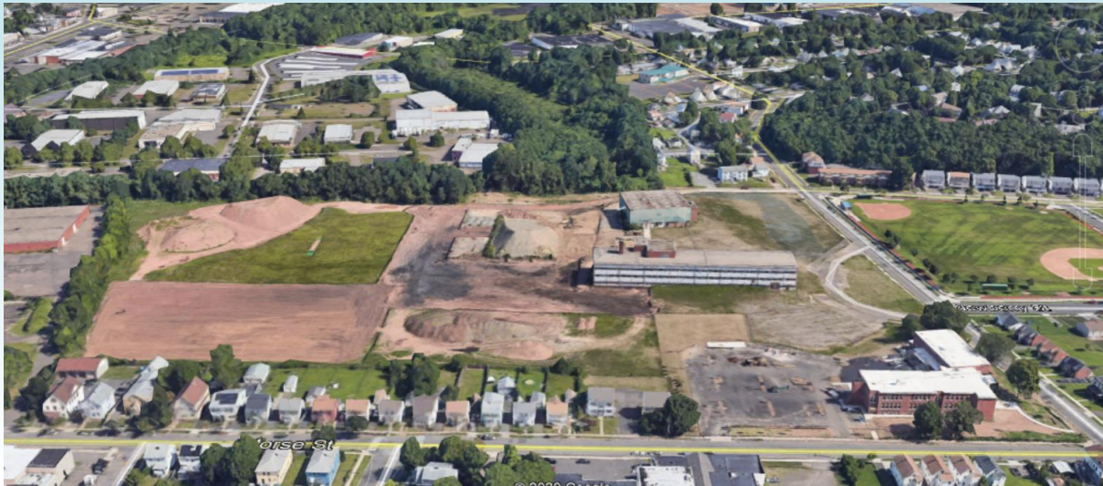
Aug 2019 Google Earth